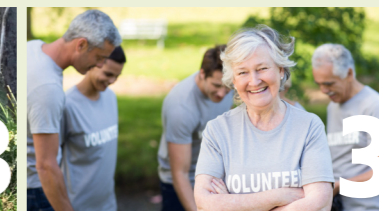
Now Recruiting Volunteers Your visit changes the day