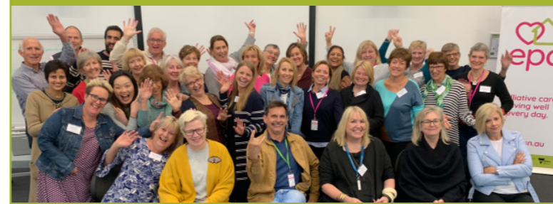
Enriching our community through everyday acts of kindness

Visit epc.asn.au or call us for a chat on 1300 130 813