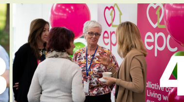
Donor Appreciation High Tea Save the date - 27 May