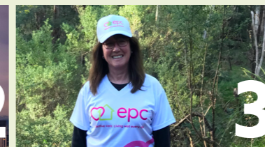
Pound the Pavement 4 EPC Community Fundraiser