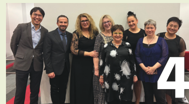
4 Oceanic Palliative Care Conference