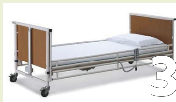
3 Giving Tuesday Appeal