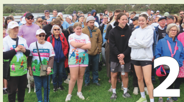
2 Pound the Pavement 4 EPC - A huge success!