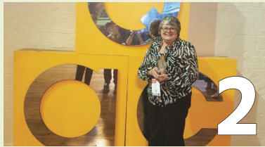
Lu Dat Award Winner