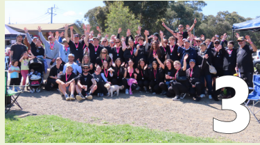
POUND THE PAVEMENT 4 EPC!