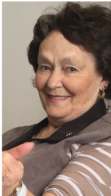
EPC Client, Beverley (Vale, 2022)