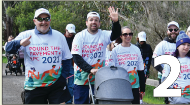
Pound the Pavement 4 EPC Sunday 8th October

EPC is located in Melbourne on Wurundjeri Country. EPC wishes to acknowledge the traditional owners of this land, the Wurundjeri People and their Elders past, present and emerging.