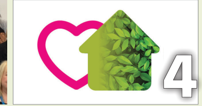
EPC Going Green Initiatives Your Input is Needed