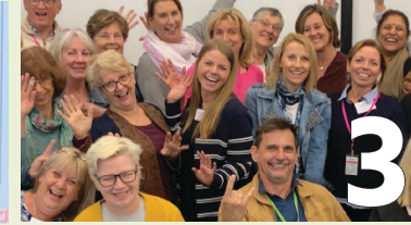
Volunteer with EPC!