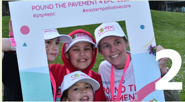
2 POUND THE PAVEMENT 4 EPC A record fundraiser