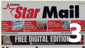
3 EPC in the Media