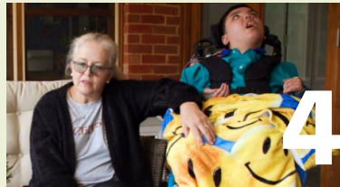
4 Our EPC Experience A Carers story