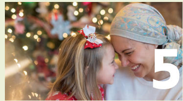
5 Donate to EPC this Season