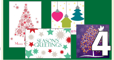
Christmas Cards Announcing our 2022 designs