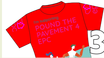
POUND THE PAVEMENT 4 EPC - Register Now