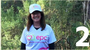
2 Pound the Pavement 4 EPC Sunday 9th October!