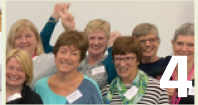
4 Now Recruiting Volunteers Your visit changes the day