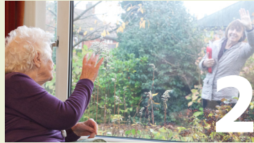
2 EPC's Stay at Home Appeal