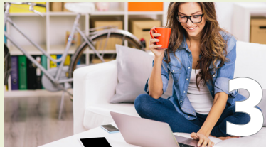
3 EPC's 2022 Online Auction Breaks its record!